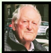
By Tom Goode

The whispers have floated around the Garrick Theatre like stray feathers from a particularly dramatic costume, of a performer meeting their end mid-scene on our hallowed stage. Was it true, or just backstage folklore passed down through the years? As it turns out, the tale is no mere theatrical fable. What began as a rollicking rehearsal full of laughter but took a tragic and unforgettable turn.